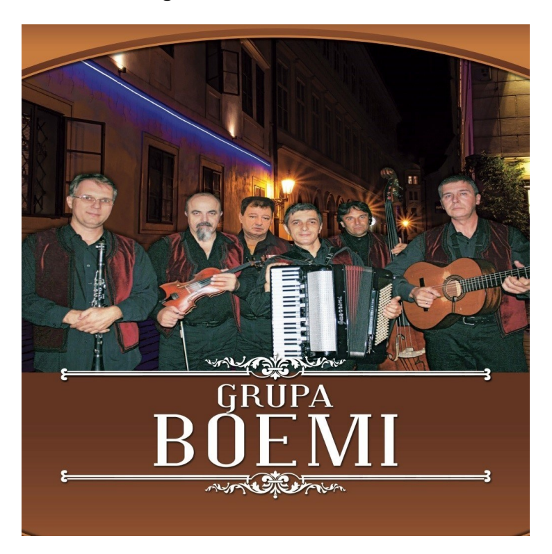
and Party Band

Visit the Silent Auction at designated area in the hall. Auction closes at 11 PM.