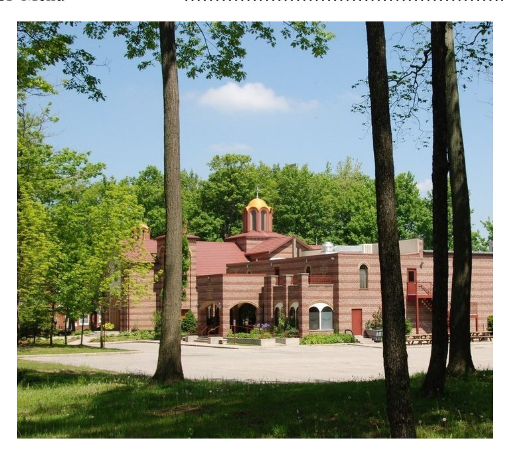
Holy Trinity Church and Hall, located at 700 Fischer-Hallman Rd, Kitchener, Ontario, Canada, N2E 1L7